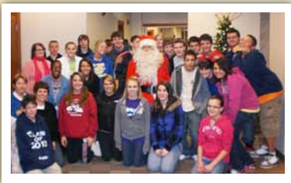
Participants enjoy a moment with Santa at CYO's Christmas party.