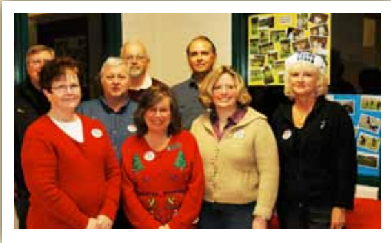
Members of the Original Circle City Corvette Club were a big help at the annual Elvis concert.