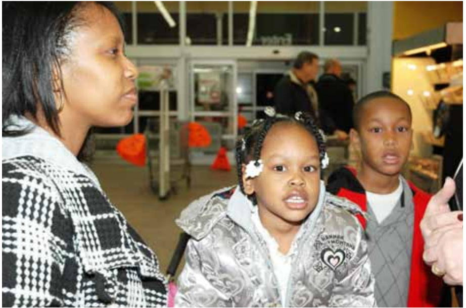
Damar Elves at work shopping for client Christmas gifts at Walmart.