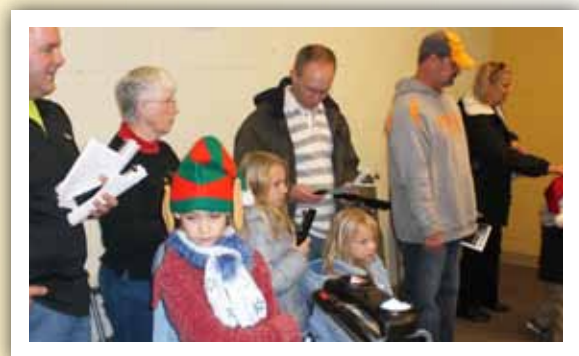
Southport Middle School staff and family sing carols to Damar clients.