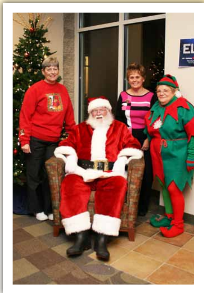
Members of Delta Theta Tau Sorority pose for a picture with Santa and his elf helper.