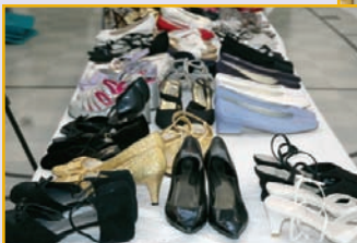
Donations of elegant shoes line the table.